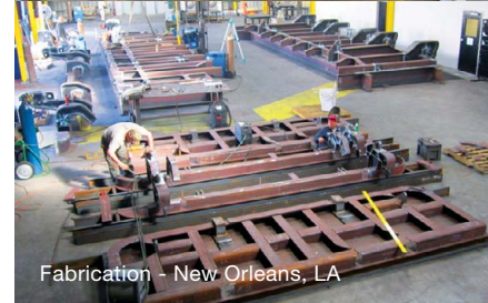
Fabrication - New Orleans, LA