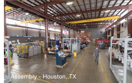
Assembly - Houston, TX